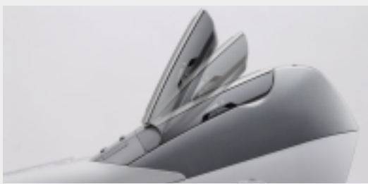
• The LCD display can be tilted to the optimal reading angle.